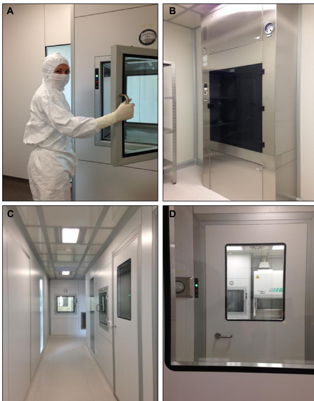
Figure 1 Representative pictures of the classified areas inside the Cell Factory.

Notes: (A) A GMP operator at work. The ventilated pass box is used to introduce the materials in the cleanroom. (B) An air shower in the storage room of a production site. It is used to remove the dust before introducing the materials in the classified areas. (C) Exit lane from the cleanroom. Each working room has its own, separated exit for the personnel and pass box for the materials. (D) An overview of the area for the preparation of materials. To access this area the operator must go through rooms of increasing air cleanliness.