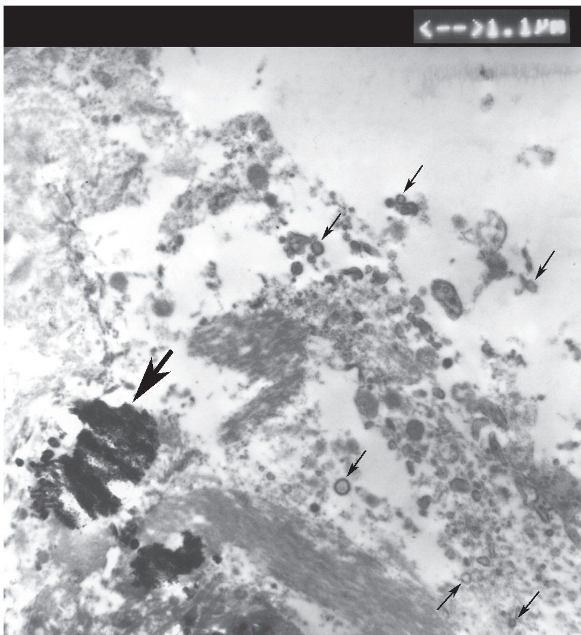
Figure 3 Transmission electron microscopy image of encrusted cystitis calcifications (magnification 7,000) demonstrating multiple calcifying nanoparticles (some indicated by black thin arrows) with the characteristic electron-dense shell (ring structures 165 nm to 440 nm) surrounding a central electron lucent core. A thick black arrow points to the micron-size calcium aggregate about 3 square microns.

that by further merging have ultimately become plaques of encrusted cystitis visible by light microscope (Figure 2) and naked eye (Figure 1).