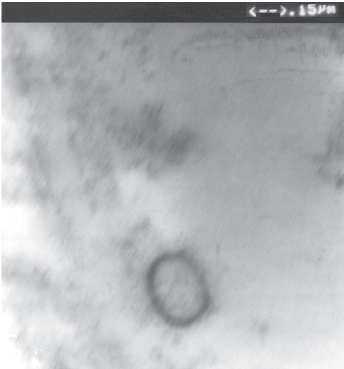
Figure 4 Calcifying nanoparticle (280 nm × 230 nm). Transmission electron microscopy image (magnification 50,000) presenting characteristic electron-dense shell surrounding an electron lucent core.

encrusted cystitis is alkaline cystitis due to urea splitting bacteria (mainly Corynebacterium group D2). However, it was found later (Huget-Perez et al 1999) that not all patients with encrusted cystitis have alkaline urine implying that other mechanisms for calcifications may play role in the genesis of encrusted cystitis. Our patient had acidic urine with a pH of 5 and standard urine culture (not prolonged) for common microorganisms showed no growth. It has not been documented in the literature that nanobacteria or calcifying nanoparticles can split urea. It has been demonstrated in vitro (Çiftçioglu et al 2008) that nanobacteria (calcifying