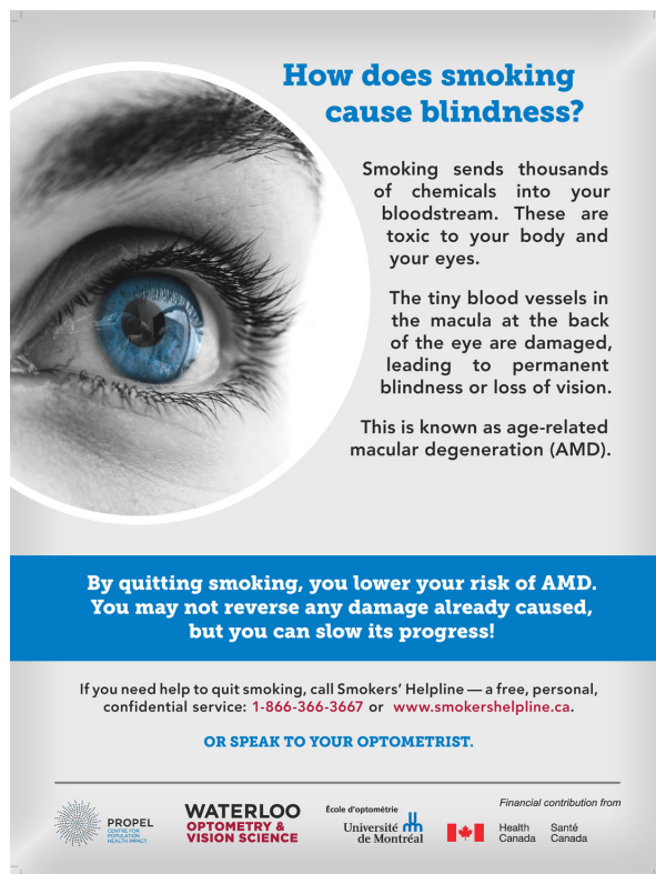
Figure 5 Poster for optometry clinic – explaining the causal association between smoking and vision loss.

Notes: Reproduced from University of Waterloo. Propel Centre for Population Health Impact. How does smoking cause blindness? [poster]; 2012. Available at: https://uwaterloo.ca/propel/sites/ca.propel/files/uploads/files/HowSmokingCauses-BlindnessPoster_en.pdf . Accessed October 6, 2015. 77 Public License and Disclaimer of Warranties and Limitation of Liability are available at: http://creativecommons.org/licenses/by-nd/4.0/legalcode .