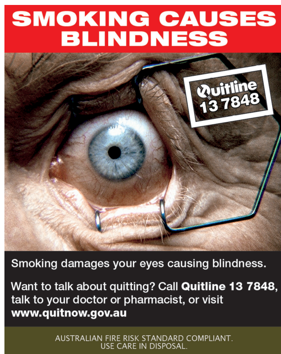
Figure 1 Australian health warning label, 2011.

The Centers for Disease Control and Prevention (CDC) in the US has included the impact of smoking on vision loss