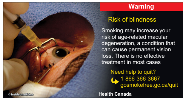
Figure 2 Canadian health warning label, 2012.

Notes: Copyright 2011 © Commonwealth of Australia. Courtesy of the Australian Government Department of Health.