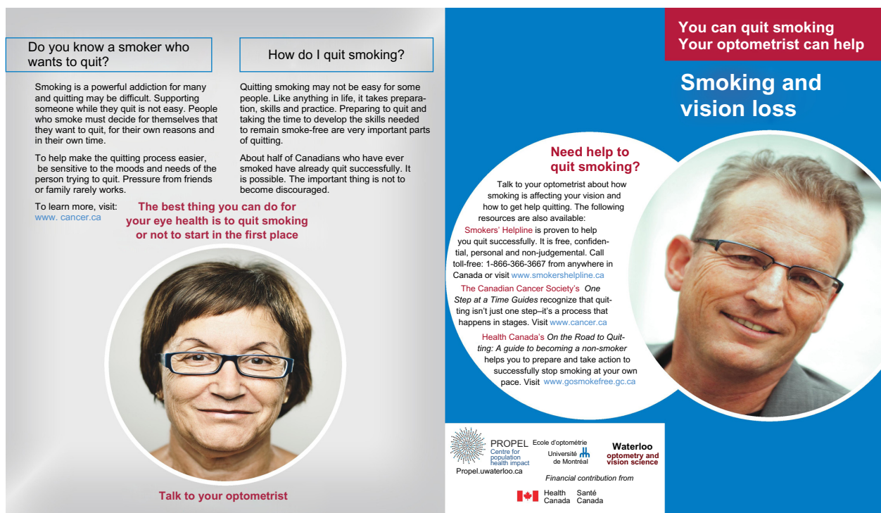
Figure 6 Front and back covers of information pamphlet.

Notes: Reproduced from University of Waterloo, Propel Centre for Population Health Impact. Smoking and your eye health brochure – English ; 2012. Available at: http://bit.ly/PropelEyeHealth . Accessed October 6, 2015. 78 Public License and Disclaimer of Warranties and Limitation of Liability are available at: http://creativecommons.org/licenses/by-nd/4.0/legalcode .