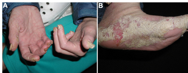
Figure 2 Our patient had hyperkeratotic white plaques on her soles, hands, and perianal digits (A and B); manifestations of crusted scabies (B).

Cytogenetic analysis revealed a female karyotype with a duplication within the short (p) arm of chromosome 1. Duplication breakpoints were assigned to G-band regions 1p36.11 and 1p36.21 [dup(1)(p36.11p36.21)] (Figure 3A).