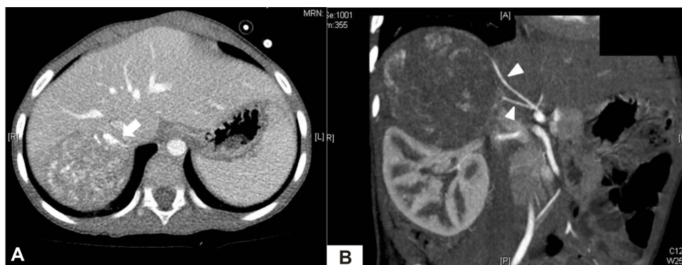
Figure 1 Preoperative CT scan.

A diagnosis of pheochromocytoma typically stems from hallmark features, including catecholamine metabolite elevations in blood and urine, using radiologic tests for localization. Usually, homogeneous enhancement is found on CT or magnetic resonance scans of pheochromocytomas, but heterogeneous enhancement is feasible (thus mimicking NBL) if a tumor necrosis occurs. 8 In the absence of tissue confirmation, NBL with excessive catecholamine production and pheochromocytoma may thus be impossible to differentiate by blood and/or radiologic testing. 9 Positron emission tomography may be a useful imaging study for pheochromocytoma in the near future, and if specific agent, such as 6-(18F)-fluorodopamine, becomes generally available,