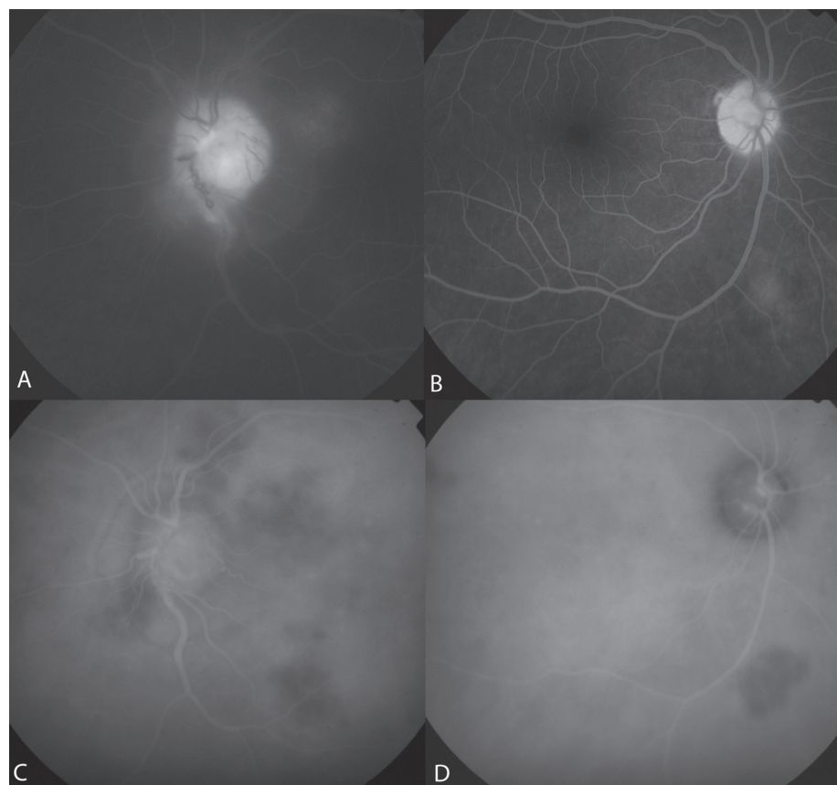
Figure 3 A , Late-phase fluorescein angiogram OS showing optic disc leakage secondary to uveitis. B , Late-phase fluorescein angiogram OD exhibits an hyperfluorescent area corresponding to the granuloma. C , Late-phase ICG angiogram OS reveals multiple choroidal hypofluorescent lesions of the posterior pole, optic disc leakage secondary to uveitis. D , Late-phase Indocyanine angiogram OD showing a single hypofluorescent area corresponding to the granuloma.