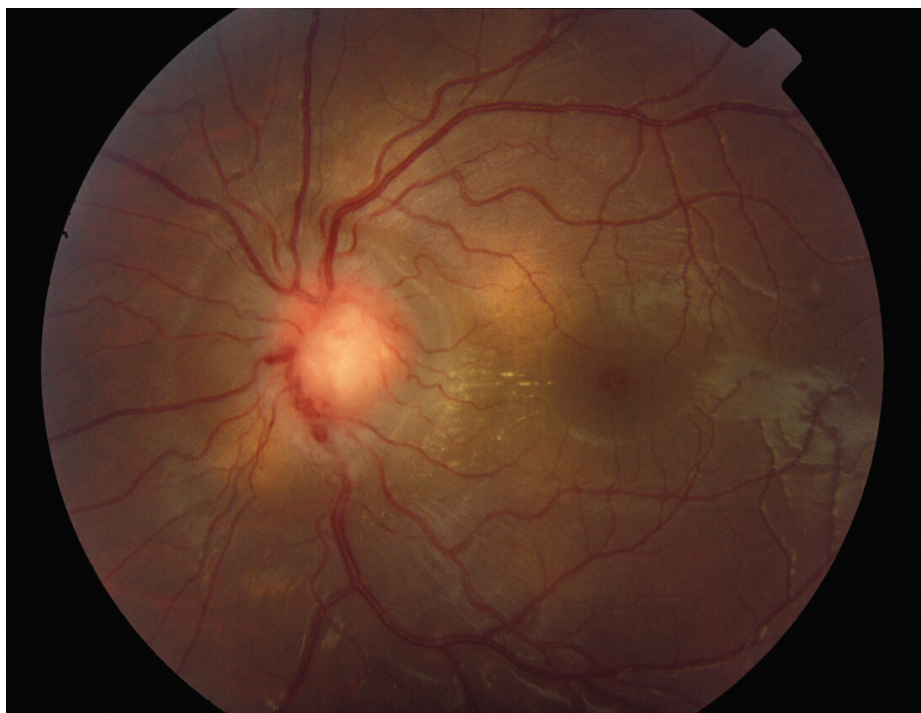
Figure 2 Fundus photograph OS shows the optic nerve granuloma caused by direct sarcoid tissue infiltration.