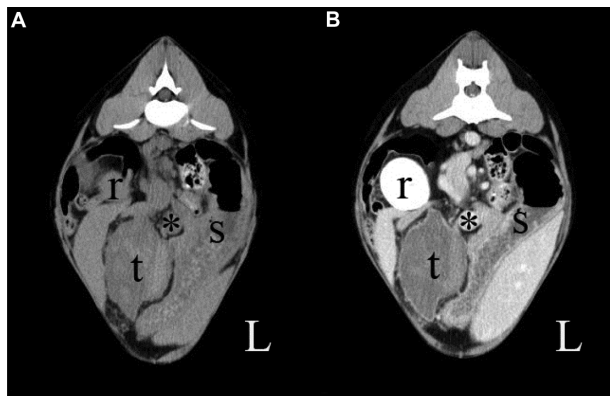
Figure 2 Pre-contrast (A) and post-contrast (B) computed tomography images of the cranial abdomen in soft tissue windows.

Notes: The right kidney (r), stomach (s), and portal vein (*) are present at this level. The torted liver lobe (t) is irregularly margined and centrally heterogeneous with poor contrast medium administration; however, it enhances along its peripheral margin with contrast medium. L indicates the left side of the patient.