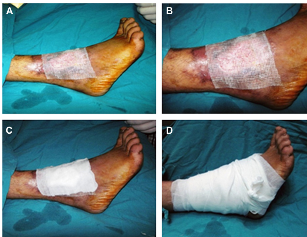
Figure 3 Vaseline dressing is added over amniotic membrane and then covered with dressing.

All patients were males between 26 and 43 years. In group I, there were a total of eleven leg ulcers. Age ranged from 26 to 43 years with a mean value 34.45 \pm 7.03 . Nine ulcers