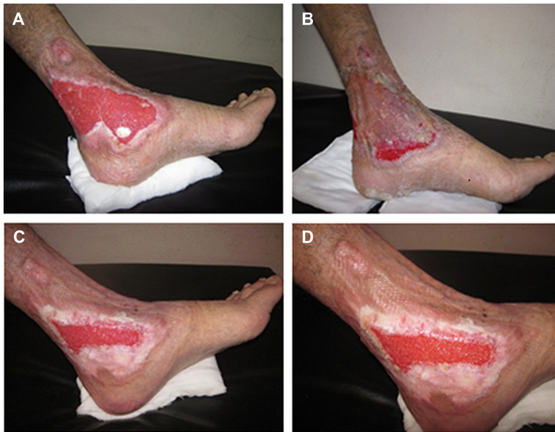
Figure 4 Healing of two leg ulcers after amniotic membrane application.

Notes: Two leg ulcers in one patient (A); application of amniotic membrane on the two ulcers (B); reduction in size of both ulcers (C); complete healing of the upper ulcer and 70% reduction in the size of the lower one on follow up (D).