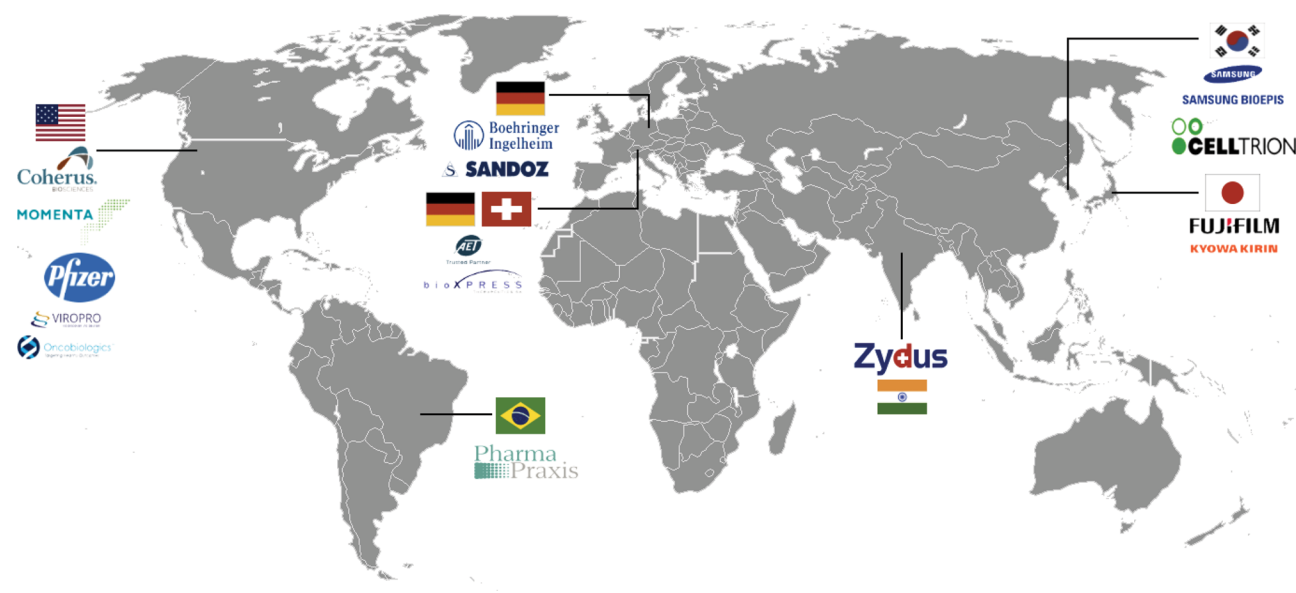
Figure 2 Adalimumab biosimilars candidates.

On December 9, 2014, in India, Cadila Healthcare Ltd. launched what it called the first adalimumab biosimilar, ZRC-3197. 128 This molecule was produced in genetically manipulated CHO cells containing adalimumab heavy and