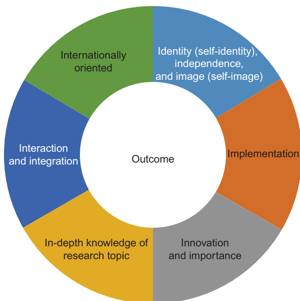
Figure 3 Determinants associated with a successful outcome in a postdoctoral program.

1. Identity, Independence, and Image (self-image): postdoctorals who are “big picture” thinkers and aware of their own reputation, and their value in the research community, in a realistic way, often develop into successful independent researchers. Those who are committed to self-management and interested in leadership in research institutions possess essential positive characteristics. As well, postdoctorals who are persistent, who can tolerate