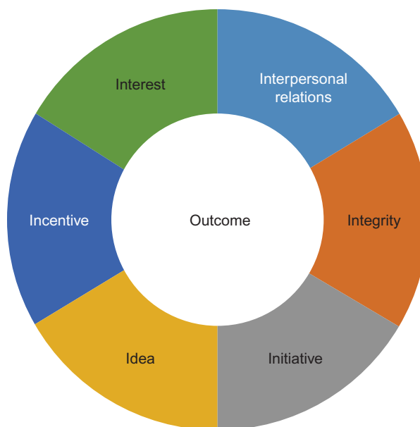
Figure 2 Determinants associated with the successful doctoral student.