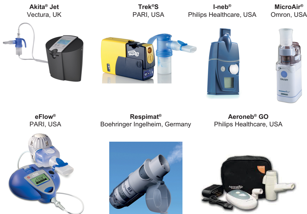
Figure 1 Examples of commercially available nebulizers that incorporate newer aerosol generating technologies.

Notes: Akita® Jet (Courtesy of Ventura, UK) and the I-neb® (Courtesy of Philips Healthcare, USA) employ AAD technology to deliver and monitor nebulizer treatments. Trek® S (Courtesy of PARI, USA; Trek® S is a trademark of PARI GmbH and its affiliates) is a portable jet nebulizer. MicroAir® NE-U22 (Courtesy of Omron, USA) and the eFlow® (Courtesy of PARI, USA; eFlow® is a trademark of PARI GmbH and its affiliates) are vibrating mesh aerosol nebulizers. RespiMat® is a high-efficiency soft mist inhaler (Reproduced with permission from Boehringer Ingelheim Pharmaceuticals, Inc. RespiMat® is a trademark of and/or used under license from Boehringer Ingelheim International GmbH or its affiliated companies. Materials may also be subject to copyright protection). Aeroneb® Go (Courtesy of Philips Healthcare) is an ultrasonic nebulizer. All of these devices are approved for use in the US.