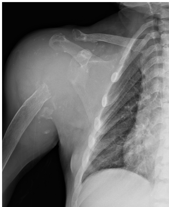
Figure 4 Anteroposterior right shoulder radiography of a male patient on long-term renal replacement treatment.

Notes: DRA totally destroyed right humerus head. Deltoid and proximal humerus area is occupied by amorphous irregular lesion.