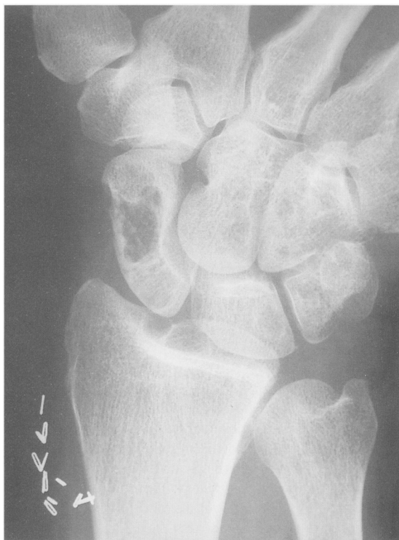
Figure 6 Anteroposterior radiography of a hand with classic amyloid cysts throughout the carpus and distal radius, typical locations of DRA bone cysts.

Abbreviations: DRA, dialysis-related amyloidosis; HD, hemodialysis.