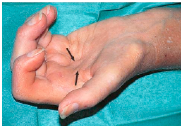
Figure 5 Hand involvement in DRA.