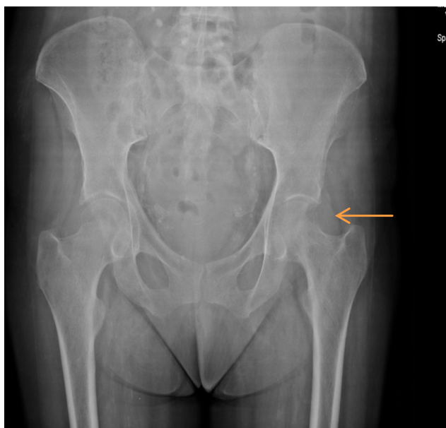
Figure 3 Anteroposterior pelvis radiography of a patient who has been receiving hemodialysis for almost 30 years.

Note: Aggressive osteolytic lesion in the left femoral neck (see arrow) (Courtesy of Department of Nephrology and Dialysis, Hospital “Guglielmo da Saliceto”, Piacenza, Italy).