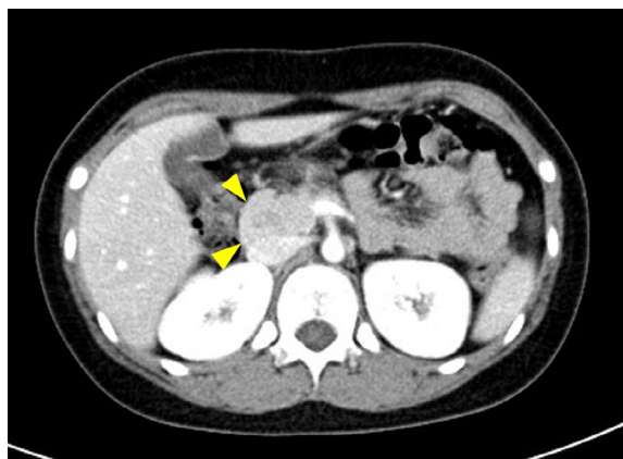
Figure 1 Study of the patient's duodenum.

Notes: (A) UGI study. Note the narrowed segment of the second part of the duodenum (arrow). (B) ACT scan. Pancreatic parenchyma encircling the second part of the duodenum is seen (arrowheads).