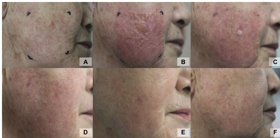
Figure 3 Local skin reactions (LSRs) after applying low amount ( 10 \text{ mg/cm}^2 ) of ingenol mebutate in patient no. 23: (A) before application; (B) on day 1 after the first application (the application was discontinued due to the occurrence of bulla, maximum composite LSR score: 9); (C) after 2 days; (D) after 3 days; (E) after 2 weeks; and (F) after 1 month (composite LSR score: 1).

the RAG, and 27 received the lower amount ( 10 \text{ mg/cm}^2 ), forming the LAG. The clinical stage was classified into three grades in RAG and LAG, respectively. There was no statistically significant difference in age and clinical stage distribution between the two groups.