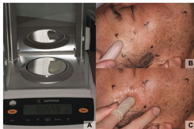
Figure 1 An example of application: after measuring the area of application site, the amount of ingenol mebutate (IM) to be applied is measured using a precision balance (A). The amount of IM is then equally spread to the affected area with a gloved finger (B and C).

Therapeutic outcomes were clinically evaluated 2 months after the initial IM application by using photographs and medical records. The following variables were included in the analysis: completion of three consecutive applications; composite LSR score; pain score; clearance rate of AK lesions. Each patient's clearance rate was calculated as: (the number of AK decreased after treatment/the number of AK before treatment) × 100 (%). Partial clearance was defined as