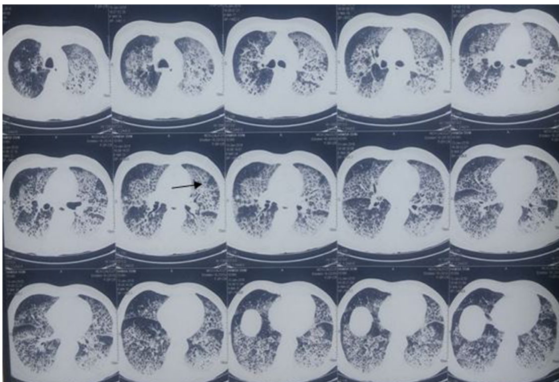
Figure 2 HRCT of thorax showing diffuse alveolar opacities scattered throughout lung fields (arrow).

is an uncommon and life-threatening complication of fibrinolytic therapy and should be considered as one of the differential diagnoses of pulmonary infiltrates or a decreasing level of hemoglobin after thrombolysis. 1,2 There are no data regarding the exact incidence of this complication, except for a few case reports. It usually develops within a few hours to 5 days after thrombolysis. Some predisposing factors include immunodeficiency, pneumonia, chronic obstructive pulmonary disease, congestive heart failure and cocaine and tobacco