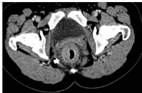
Figure 3 Computed tomography scan of 29-year-old woman with signet-ring cell carcinoma of the rectum.

Notes: Computed tomography scan shows mass-forming rectal wall thickening with heterogeneous enhancement (arrow).