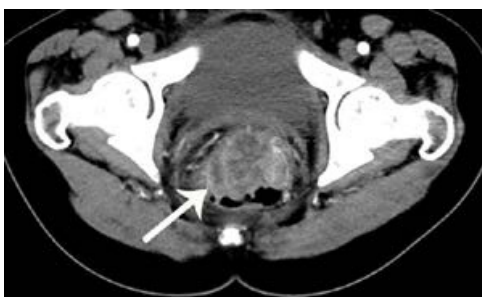
Figure 2 Computed tomography scan of 55-year-old man with nonmucinous carcinoma in rectum.

Some recent studies have found out that MAC and SC of the rectum show a poor response to neoadjuvant chemoradiation