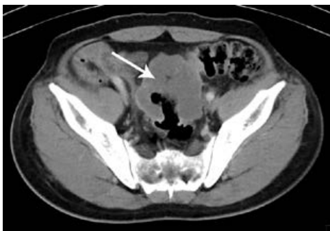
Figure 1 Computed tomography scan of 52-year-old man with mucinous carcinoma in rectum.

Notes: Computed tomography scan shows severe rectal wall thickening with large areas of low attenuation (arrow).