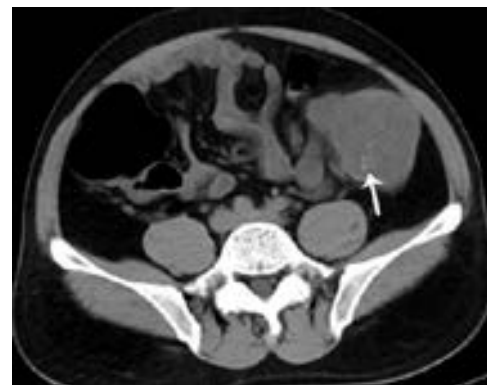
Figure 8 Computed tomography scan of 44-year-old man with mucinous carcinoma in descending colon.

In accordance with the majority of published literature reports, 7,20 MAC showed the presence of CT signs, such as bowel-wall thickness >2 cm, long segmental and eccentric bowel-wall thickening, heterogeneous enhancement of the lesion with poor enhancement of the solid portion, a large area of hypoattenuation, and intratumoral calcification, which indicated the high likelihood of the MAC. However, in our study, there was no difference in the thickening, involved long segmental bowel wall, and pericolic fat infiltration between MAC and SC ( P=0.555 , P=0.249 , P=0.542 ), but MAC and SC appeared more severe than AC ( P<0.01 ). This might be associated with the pathological grading of MAC and SC. Because both MAC and SC were classified