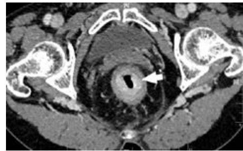
Figure 7 Computed tomography scan of 59-year-old woman with signet-ring cell carcinoma of the rectum.

Notes: Computed tomography scan shows large mass with heterogeneous enhancement. Hypoattenuated area is greater than two thirds of tumor, and enhancement in solid portion of tumor is less than that of normal bowel wall (arrow).