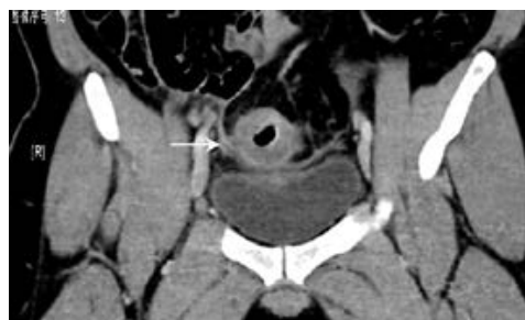
Figure 4 Computed tomography scan of 32-year-old man with signet-ring cell carcinoma of the sigmoidum.

Generally, SC and MAC were considered uncommon histological colorectal cancer subtypes with differences in clinical and histopathological findings. The SC was first reported in the literature by Laufman and Saphir, 9 and the incidence of SC was reported to range from 0.1 to 2.4%. 9,12-14 The incidence of MAC was about 10%. 12,14,15 Because of their rare occurrence, the preoperative diagnosis of MAC and SC is difficult. It is important to recognize the specific clinical, pathological, and biological differences among the SC, MAC, and AC. In comparison with AC, both MAC and SC have been shown to be associated