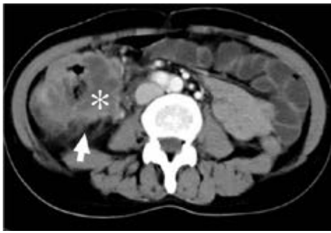
Figure 5 Computed tomography scan of 53-year-old woman with mucinous carcinoma in cecum and proximal ascending colon.

Notes: Computed tomography scan shows concentric uneven bowel-wall thickening along with evidence of pericolic fat infiltration (arrow). Hypoattenuated area is greater than two thirds of tumor (asterisk).