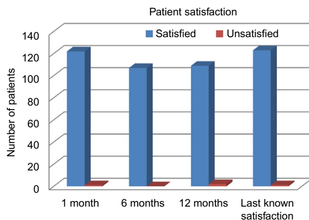
Figure 3 Patient satisfaction at 1-, 6-, and 12-months postoperative and last known satisfaction for each patient.

readjusted once each to achieve a completely flat alignment, without necessitating removal of the patch from the defect.