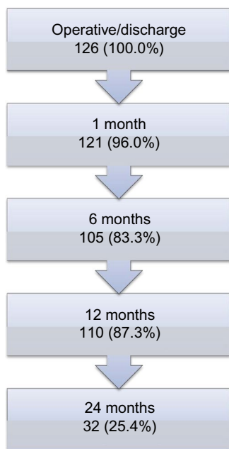
Figure 1 Patient follow-up visit completion.

Protocol recommendations for mesh sizes were followed for 107/126 (84.9%) patients. All patients who experienced recurrence had received the recommended size patch according to the hernia diameter (Table 2). There was no significant difference between the patch overlap (mesh–hernia diameter)