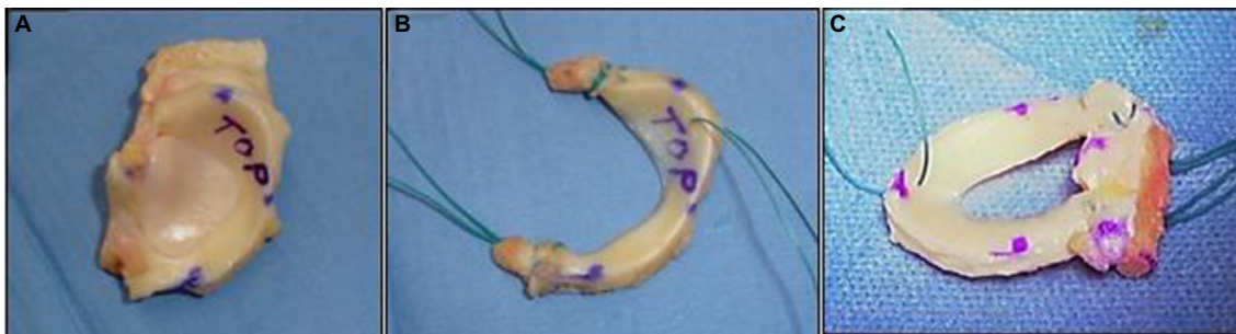
Figure 2 (A) The meniscal allograft provided on the bone of the proximal tibia to maintain size and configuration. (B) After preparation, a medial meniscus transplant shown with small bone cylinders at the anterior and posterior horns. Sutures are placed through these bone cylinders along with a suture through the posteromedial body of the meniscus to aid with insertion of the transplant into the knee. (C) A lateral meniscus transplant is prepared from a similar segment of proximal tibia. A bone block is shaped to include the attachments of both the anterior and posterior horns. Sutures are placed in a similar way to aid insertion into the knee.

Traditional open suture techniques have been replaced with inside-out arthroscopic sutures by the majority of the reporting authors with newer all-inside sutures being used in a number of more recent articles. There are no clinical data currently endorsing one fixation technique over another.