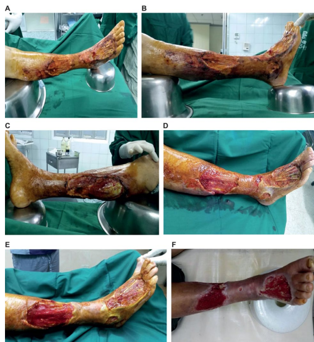
Figure 1 Time course of wound management with BETAplast™ N and BETADINE® in an adult diabetic patient with necrotizing fasciitis.

Treatment was immediately initiated with empiric piperacillin-tazobactam, along with tetanus prophylaxis and an antithrombotic agent. Surgical debridement was performed, and the patient was referred to the vascular service. The patient eventually underwent sequential sharp debridement with fasciectomy. Multidisciplinary consultation with staff endocrinologists and cardiologists was undertaken to address the patient's metabolic status.