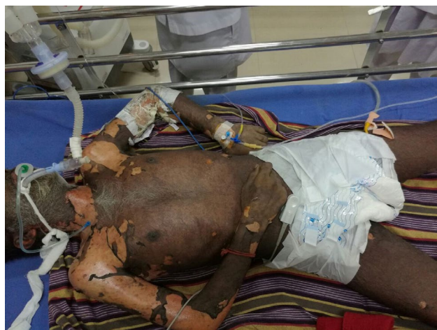
Figure 1 Image showing the patient incubated with evidence of extensive involvement of the skin of neck and limbs.

He had multiple ruptured bullae all over the body and erythematous skin. Oral and conjunctival mucosae were also involved (Figure 2). Dermatology opinion was sought. More than 30% of the body surface area was involved. Provisional diagnosis of SJS was made. Investigations revealed elevation in cardiac biomarkers. Echocardiogram revealed global hypokinesia. Prothrombin time was 15 s. Activated partial thromboplastin time was 32 s. Platelet count was 143,000 L/mm 3 . Results of liver function tests were normal.