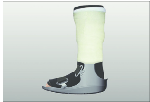
Figure 3 The instant total contact cast.

Achilles tendon lengthening is an effective method to reduce the recurrence of plantar diabetic neuropathic ulcers of the forefoot in patients with limited ankle range of motion. The percutaneous procedure involves three stab incisions and can