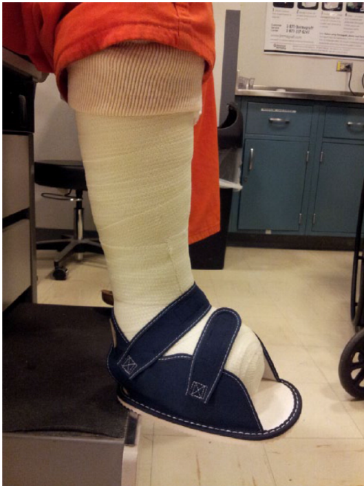
Figure 2 Total contact casts are the gold standard for offloading diabetic neuropathic wounds, yet are quite cumbersome for patients and take significant time and expertise to apply properly in the clinical setting.

applied haphazardly, it can worsen a wound and allow the spread of infection as the cast prevents daily wound inspections and dressing changes.