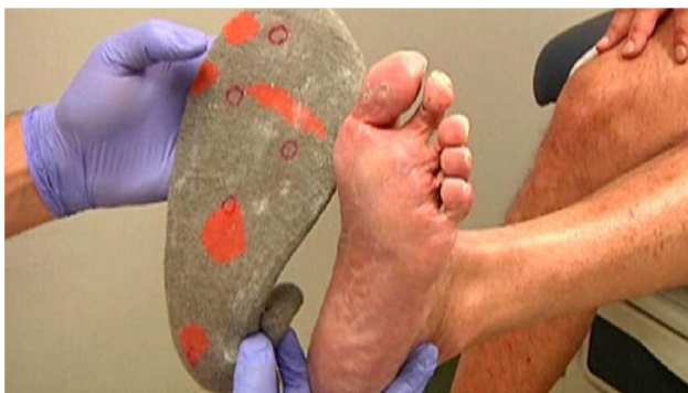
Figure 4 SmartSox uses fiber optic cables embedded within socks to warn the patient of peaks in plantar pressure.

Because shear stresses contribute to the formation of diabetes-related foot ulcers, a 2014 study published in the Journal of Diabetes Science and Technology evaluated the effect of a custom, novel shear-reducing insole on the thermal