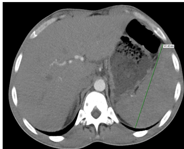
Figure 3 CT abdomen showing enlarged spleen measuring 14.1 cm.