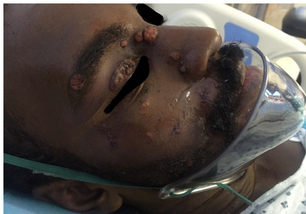
Figure 1 Photo of the patient showing the multiple cauliflower-like lesions.