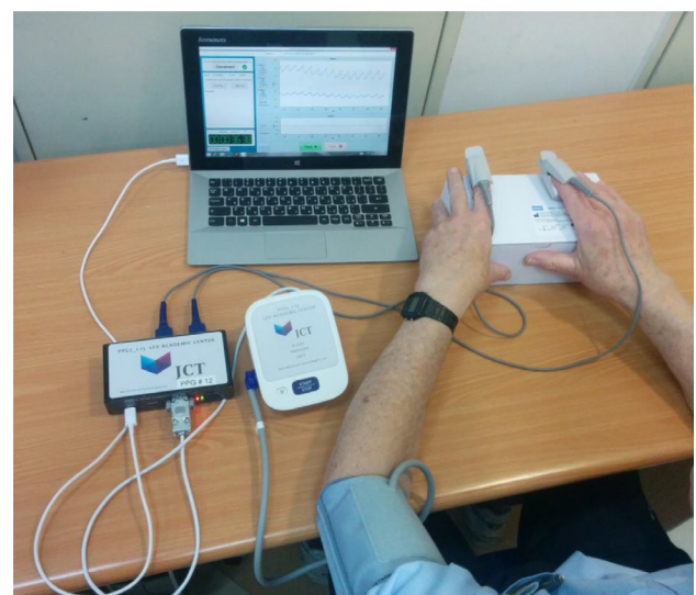
Figure 1 The PPG-based SBP measurement apparatus includes a pressure cuff wrapped around the arm and two photoplethysmographic probes on the fingers of the two hands.

We propose here an innovative approach to SBP measurement, which uses a pressure cuff wrapped around the arm and is based on direct detection of reopening of the artery under the cuff, when the air pressure decreases below the SBP value (similar to Korotkoff-based sphygmomanometry). The technique uses PPG, which measures changes of light transmission through tissue (e.g., the fingertip), due to cardiac-induced blood volume changes in the arteries. Figure 1 presents the PPG-based SBP measurement apparatus and Figures 2A and B present the photoplethysmographic probe and signal. During systole, blood is ejected from the left ventricle and increases the arterial BP and consequently the volume of the arterial blood. Due to the systolic increase in tissue blood volume, the light transmission through the fingertip decreases during systole (Figure 2B). The SBP measurement technique is based on a pressure cuff around the arm and a photoplethysmographic probe on the fingertip distal to the cuff. When the cuff pressure increases to above SBP, the artery under the cuff collapses and the PPG signal disappears. The SBP value is taken as the value of the air pressure for which the PPG signal downstream to the cuff first reap-