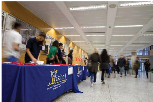
Figure 2 Conference day.

The senior conference is aimed for year 13 students and is held in September, just prior to the submission of UCAS applications. The day consists of a series of talks from distinguished members of the medical profession. Previously, physicians, surgeons and senior medical students have given talks on “life as a junior doctor,” “life as a surgeon” and “life as a medical student,” although in response to feedback