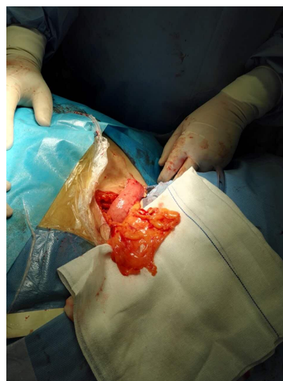
Figure 2 Pedicled omentum around the esophagogastric anastomotic site after esophagectomy.

Note: A gastric tube was made using a linear stapler with 6–8 cm of the pedicled omentum, with 6–8 cm remaining of which was attached to the top of the gastric tube, close to the proposed line of the gastric resection.