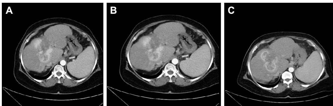
Figure 3 Based on the dynamic CT imaging obtained after the 2-step TACE procedure, a very large regression with peripheral hypodense necrosis areas was observed.

Liver metastasis was defined as one of the poor prognostic factors for CUP, and patients with liver metastases are resistant to conventional chemotherapy as in our case. 8,9 Thus, importance of arterial-directed therapies is increasing. TACE provides a dual therapeutic approach to tumors combining chemotherapeutic agents with hepatic artery embolization. This procedure increases the local chemotherapy concentration and reduces drug clearance from the liver. TARE using yttrium-90-resin microspheres ( 90 Y-RE) delivers targeted radiation therapy to tumor and reduces oxygen and nutrient delivery to the tumor like TACE. These are applied principally for the treatment of unresectable hepatic metastatic colorectal carcinoma (CRC) and HCC. In the patients with HCC, Y90 microsphere treatment has been used either to convert non-resectable disease to a disease