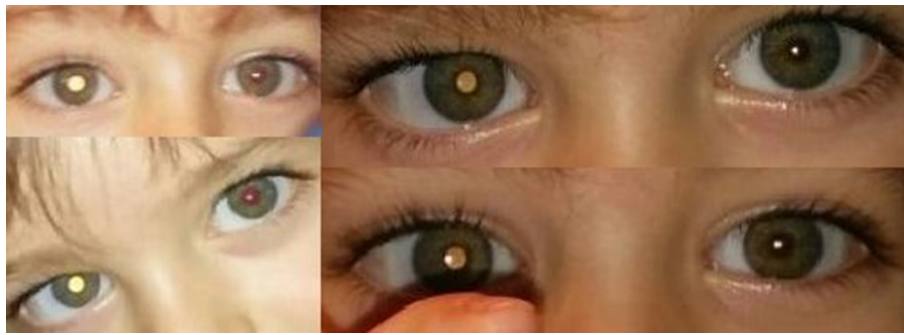
Figure 1 Four different smartphone photographs. In all pictures the child is not fixing directly on the camera, which resulted in a white pupillary reflex. Leukocoria is due to reflection off the optic nerve head.

were normal. No nystagmus was observed. He had no afferent pupillary defect. Dilated fundus examination appeared normal with a clear vitreous and no masses in the retina. The macula showed a normal reflex, and the disc margins were distinct (Figure 2). B-scan ultrasonography on the patient did not show any underlying retinal pathology (Figure 3). The child was scheduled for a 6-month review and, at the follow-up visit, his vision was 20/20 in both eyes with clear ocular media and normal fundi.