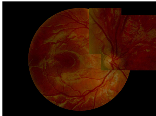
Figure 2 Color fundus photograph composition of this patient’s right eye. Optic nerve, vessels, and macula are normal. Notice the retinal nerve fiber layer, especially detectable around the fovea and vasculature, a normal finding in children.