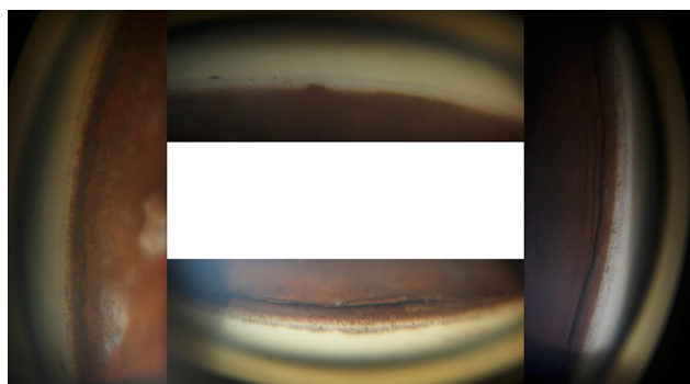
Figure 2 Gonioscopic photographs after goniosynechialysis OD showed a 360 degree open anterior chamber angle.

Gross hyphema after laser iridotomy is a rare condition. 1–3 To the best of our knowledge, we are reporting the first case of an eight-ball hyphema resulting from a laser iridotomy