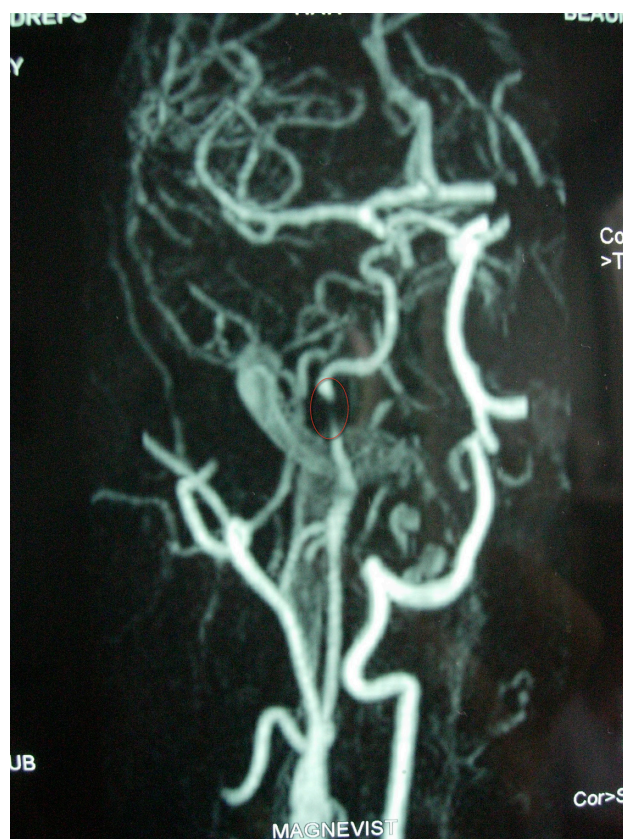
Figure 2 A magnetic resonance angiography (MRA) of patient 1, which reveals global ischemia of the right cerebral hemisphere as well as dissection of the right internal carotid artery (circled).

Infiltration of the lateral nasal wall of the middle meatus, with 2 mL of the same solution mentioned above, was performed under endoscopic guidance. An incision was made in the lateral wall of the medial meatus 1 cm anterior to the posterior attachment of the middle turbinate. A mucosal flap was raised and the ethmoidal crest and SPA identified as it exits the sphenopalatine foramen. The artery was ligated using metal clips. The mucosal flap was replaced and no nasal packs were inserted after surgery.