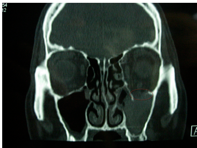
Figure 1 A computerized tomography (CT) scan of patient 1, which reveals a fracture of the left orbital floor (circled) together with multiple undisplaced nasal fractures.

were to undergo a general anesthetic. Embolization was a treatment option for the SPA although not for the anterior ethmoidal artery as this is part of the internal carotid artery system and therefore poses a significant risk of causing a CVA or embolus in the ophthalmic artery with potential visual loss. It was therefore decided that the safest option was to perform the surgery under local anesthesia. The left anterior ethmoidal artery was identified and ligated without any difficulty via the usual medial canthus incision (Lynch incision). The left SPA ligation was performed after preparing the nose with topical anesthetic and decongestant spray, a greater palatine foramen block and local anesthetic infiltration into the lateral wall of the middle meatus.