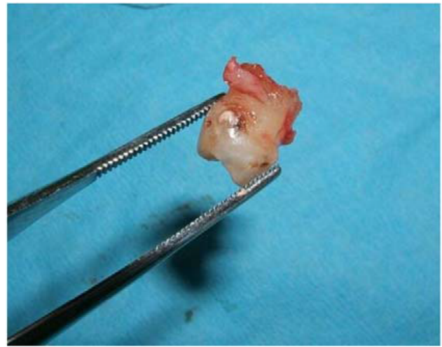
Figure 4 The unrestorable carious and exfoliating mandibular second deciduous molar was extracted.

The mandibular right second premolar site had healed well (Figure 7). This implant was planned to be placed flaplessly. A 2.5×13 mm SDI (MDL Intra-Lock International®, Boca Raton, FL, USA) was selected and placed according to SDI guidelines. 48 An osteotomy was performed with a 1.2 mm drill