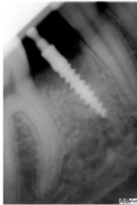
Figure 9 Radiograph during seating of small diameter implant.

EDD is a rare genetic disorder that is usually transmitted as an X-linked recessive trait. 40 Ninety-five percent of patients with EDD have the X-linked form. 40 Because of subtle manifestations, EDD is difficult to diagnose. The number of teeth that develop are a basis of diagnosis. Hypodontia, anodontia, and dental malformations are part of the disorder. Because the teeth give the alveolar ridges osseous stimulation, absence of teeth results in narrow atrophic edentulous ridges that make poor support for removable dentures. 40 Thus, endosseous implants can provide support and retention for effective function of fixed or removable prostheses. 40 However, endosseous dental implants should