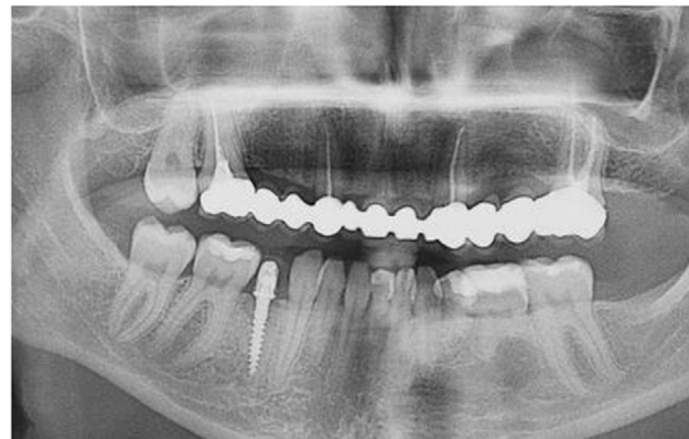
Figure 11 Panoramic radiograph after treatment completion.