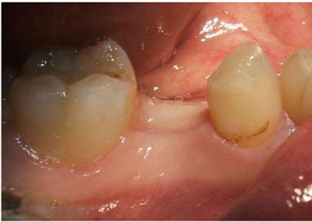
Figure 7 The healed site.