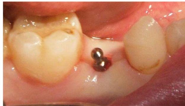
Figure 10 The implant after integration.