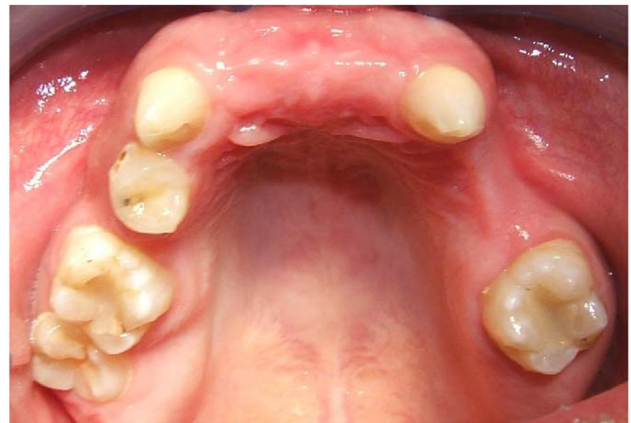
Figure 5 Healing after extractions.