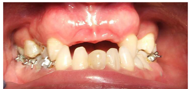
Figure 6 Orthodontic treatment was instituted.

sited equidistantly between the premolar and first molar and the center of the ridge crest. During osteotomy, a qualitative assessment of type 3 bone was made. The implant was then seated at 12 rpm and water cooled to prevent any significant insertion heat (Figures 8–10). An impression was done at insertion appointment and fabricated during the osseointegration time. After 3 months, a low cusp ceramic crown was inserted,