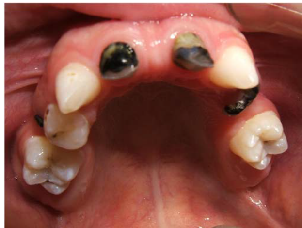
Figure 1 Maxilla of the ectodermal dysplasia patient.

A 20-year-old female affected by EDD presented with a chief complaint of a painful, mobile, and carious mandibular right second deciduous molar. Extraoral examination revealed hypotonicity of the perioral musculature. Her hair was thin and sparse. Her skin was dry, prone to rashes and easily sunburned. A medical consultation was made but no genetic testing was obtained on this patient, so a specific diagnosis type could not be made. The oral examination disclosed carious deciduous teeth and oligodontia (Figures 1–3). On the right side, missing permanent teeth were the maxillary second and third molars, second premolar, central and lateral incisors, left premolars, and second and third molars. In the mandible missing teeth were the right third molar, second premolar, left third molar and second premolar, and central incisors. Eleven teeth were absent from agenesis. The mandibular incisors were incompletely developed (Figure 2). Multiple carious deciduous teeth were deemed hopeless (Figures 1 and 2). After a discussion and informed consent was obtained from the patient to have the case details and any accompanying images published, implant treatment was decided upon.