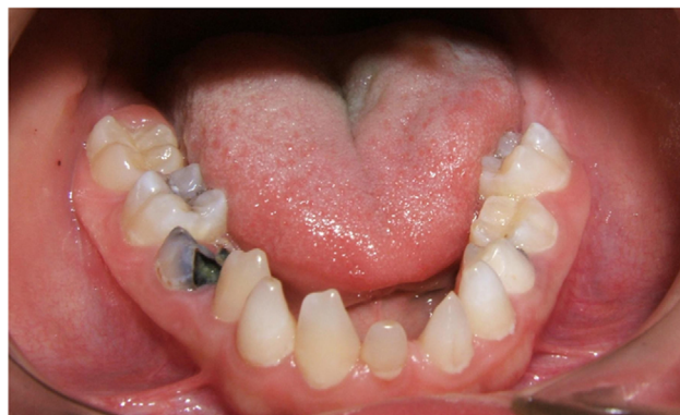
Figure 2 Mandible of the ectodermal dysplasia patient.