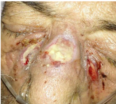
Figure 2 Severe nasal decubitus.