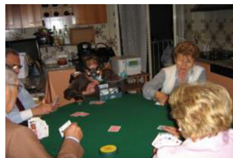
Figure 1 A patient with ALS in NIV during activities of daily life. Abbreviations: ALS, amyotrophic lateral sclerosis; NIV, noninvasive ventilation.

Today there are many types of masks available for NIV. Full-face and nasal masks are most commonly used; also,