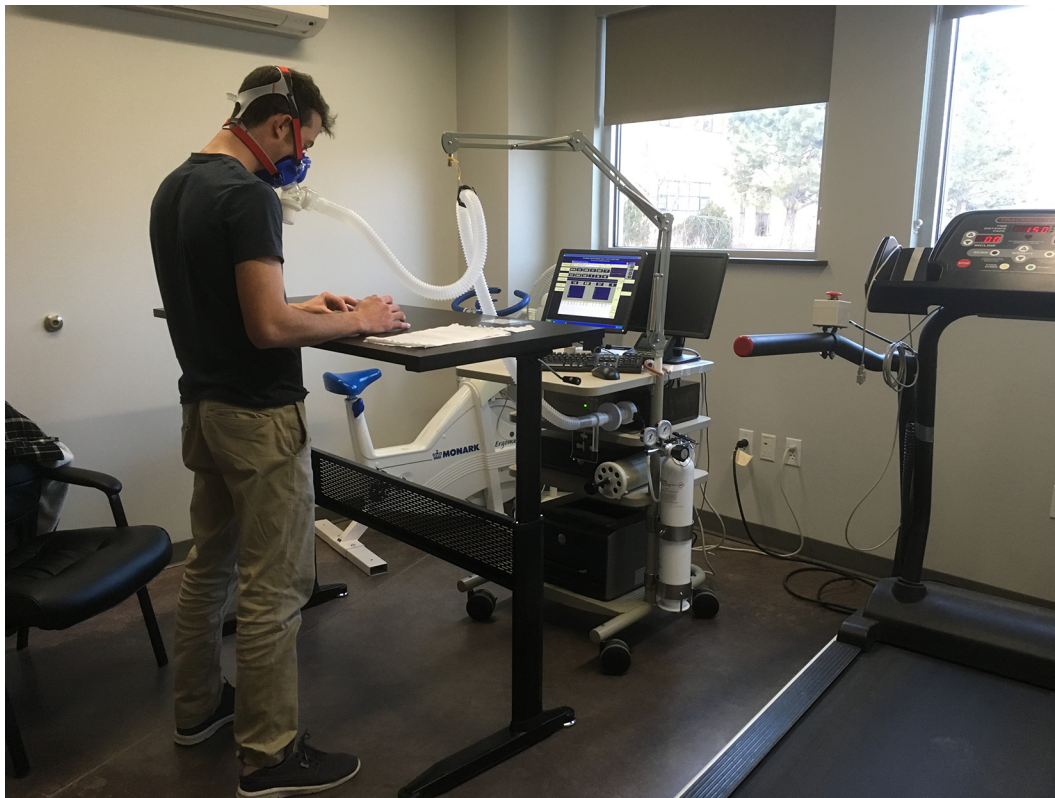
Figure 2 A study participant with the attached Parvo Medics metabolic analyzer during the measurement of standing METs. Abbreviation: METs, metabolic equivalents.

paired t -tests. Likewise, the difference in METs between standing and sitting was analyzed with a paired t -test. Lastly, the mean difference in MetS z -score between sitting and standing was calculated. To determine individual MetS z -score responsiveness to standing, delta values ( \Delta ) were calculated (standing minus sitting) to establish the change ( \Delta ) in MetS z -score. Subsequently, the participants were categorized as a “responder” if \Delta was <0 or “nonresponder” if \Delta was >0 . The alpha level of statistical significance was set at P<0.05 for all analyses.