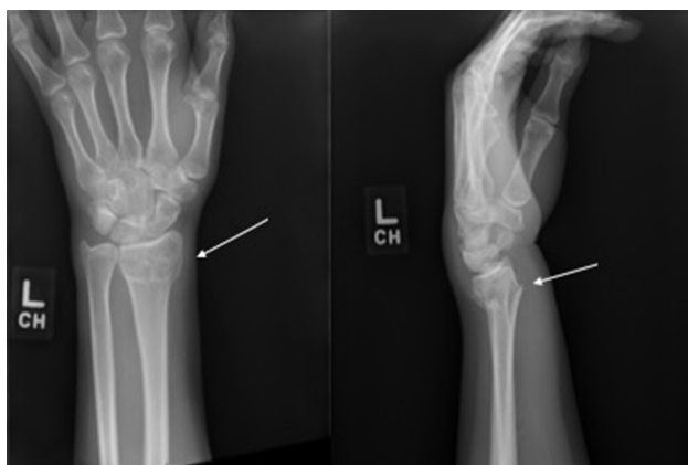
Figure 1 Distal radius fracture (white arrows).

Operatively treated distal radius fractures are typically stabilized after surgery with an irremovable splint for 10–14 days, followed by 4 weeks in a removable brace. 9 As with nonoperative treatment, range-of-motion exercises for the unaffected joints should be started immediately. Beleckas and Calfee recommended active wrist range of motion beginning at 2–6 weeks, depending on fracture severity. 9 At 6 weeks or when radiographic union is noted, passive wrist range of motion should begin and the brace discontinued. 9 The athlete may also begin strengthening exercises at 6 weeks or with evidence of union on X-ray. Most athletes regain the majority of motion and function in the first 3 months of rehabilitation, but often continue to have improvements for at least 1 year. As with nonoperatively treated distal radius fractures, return to sport typically occurs at 6–9 weeks. Henn and Wolfe recommended radiographic healing and at least 80% return to motion and strength prior to return to sport. 10 Beleckas and Calfee discussed returning to snowboarding in a cast prior to fracture healing, with the athlete's understanding that a new fall or collision may result in further injury. 9