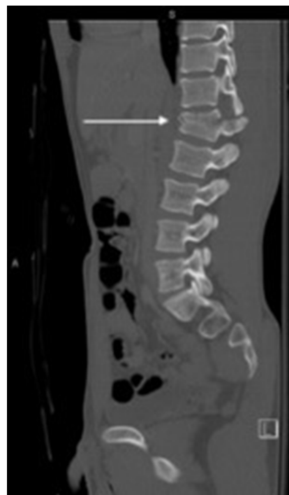
Figure 5 Lumbar spine burst fracture (white arrow).

For treatment of these spine injuries, classic principles hold true. Isolated and stable compression fractures are treated nonoperatively, with bracing indicated for some injuries, depending on location and patient comfort. Burst fractures and other unstable fractures of the spine are treated