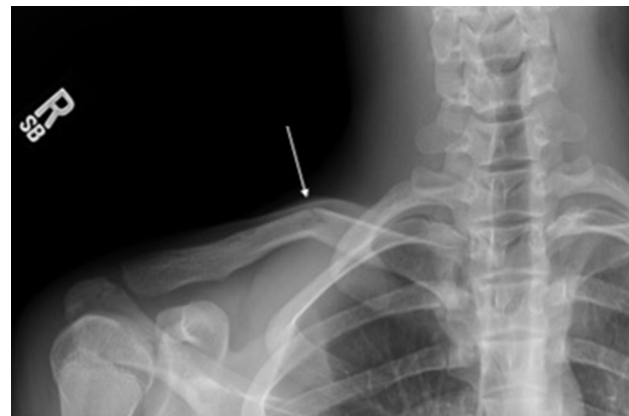
Figure 2 Clavicle fracture (white arrow).

Acromioclavicular (AC) joint injuries (Figure 3) are more common among advanced riders, given the high speed typically needed to cause the injury. 4 Ogawa et al examined the incidence of AC dislocation over five snow seasons retrospectively, and determined an incidence of 17%. 25 AC injuries are typically immobilized for 2–4 weeks. 26 Range of motion of the fingers, wrist, forearm, and elbow can begin immediately. After the period of immobilization, rehabilitation