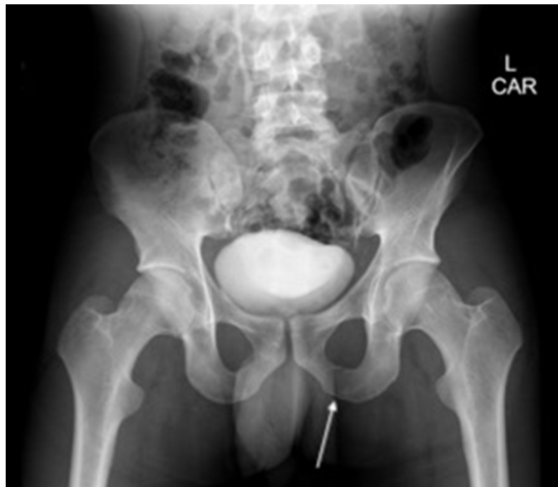
Figure 6 Isolated pubic ramus fracture (white arrow).

In a study evaluating snowboarding-related pelvic trauma, Ogawa et al found that pelvic fractures accounted for 2% of all fractures associated with the sport. 64 Falls and hard landings from jumps are the primary mechanisms of pelvic injury. Collisions with trees and ski towers tend to be less common causes of pelvic fractures, but are associated with more unstable injury patterns. Ogawa et al noted that 85.5% of all pelvic fractures in their series were stable and that pubic and ischial fractures (Figure 6) represented the largest