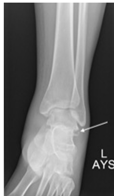
Figure 4 Lateral process of the talus fracture (white arrow).

In Ishimaru et al, 81 of 154 (52.6%) lower-extremity fractures involved the ankle. 28 Most of these ankle fractures in snowboarders occur from a supination–external rotation mechanism resulting in a short oblique fracture of the distal fibula. Patton et al similarly showed that nearly half of all ankle injuries in snowboarders involved fractures, with the majority of the fractures affecting the lead foot. 37 Appropriate management of lateral malleolus fractures depends on concomitant injuries and fracture displacement. Isolated lateral malleolus fractures with <3 mm displacement and no evidence of associated syndesmotomic injury may be