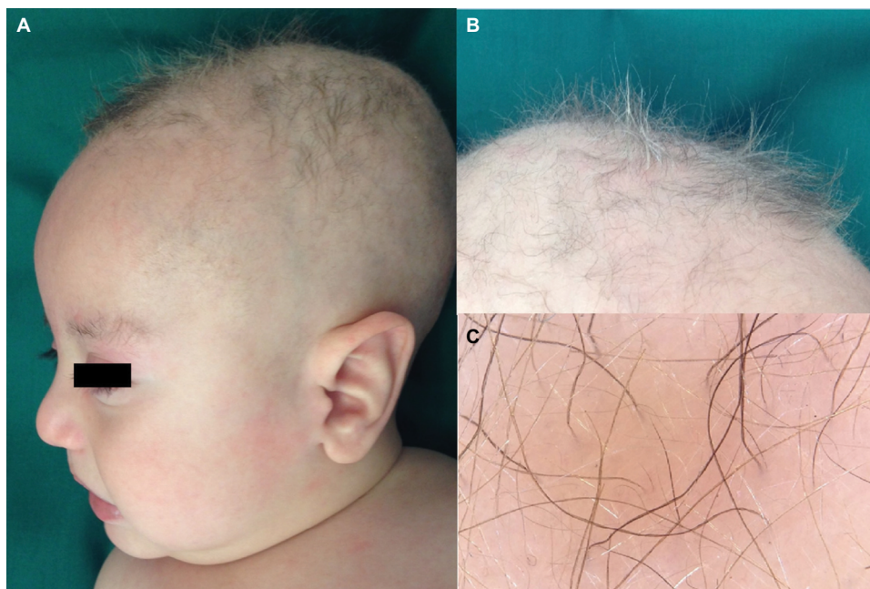
Figure 1 Clinical findings.

On the basis of clinical, radiologic, and biochemical findings, the child was diagnosed at 6 months of age with MD. Treatment with 100 \mu\text{g/kg/day} of copper-histidinate was initiated, although treatment was sometimes interrupted because of difficulty obtaining the drug in Colombia. However, after 10 months of continuous treatment, the copper and ceruloplasmin levels normalized, and his hair characteristics and muscle tone were mildly improved. A video-EEG suggested West syndrome. At 2 years of age, he had recurrent respiratory infections attributed to a swallowing disorder and gastroesophageal reflux, requiring tracheostomy. The frequency of seizures decreased, but brain magnetic resonance images showed disease progression with increased brain atrophy and a middle cerebral artery aneurysm.