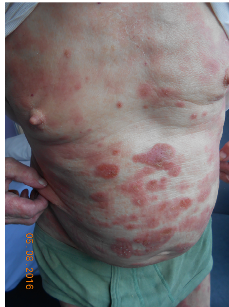
Figure 2 Mycosis fungoides “plaques” stage