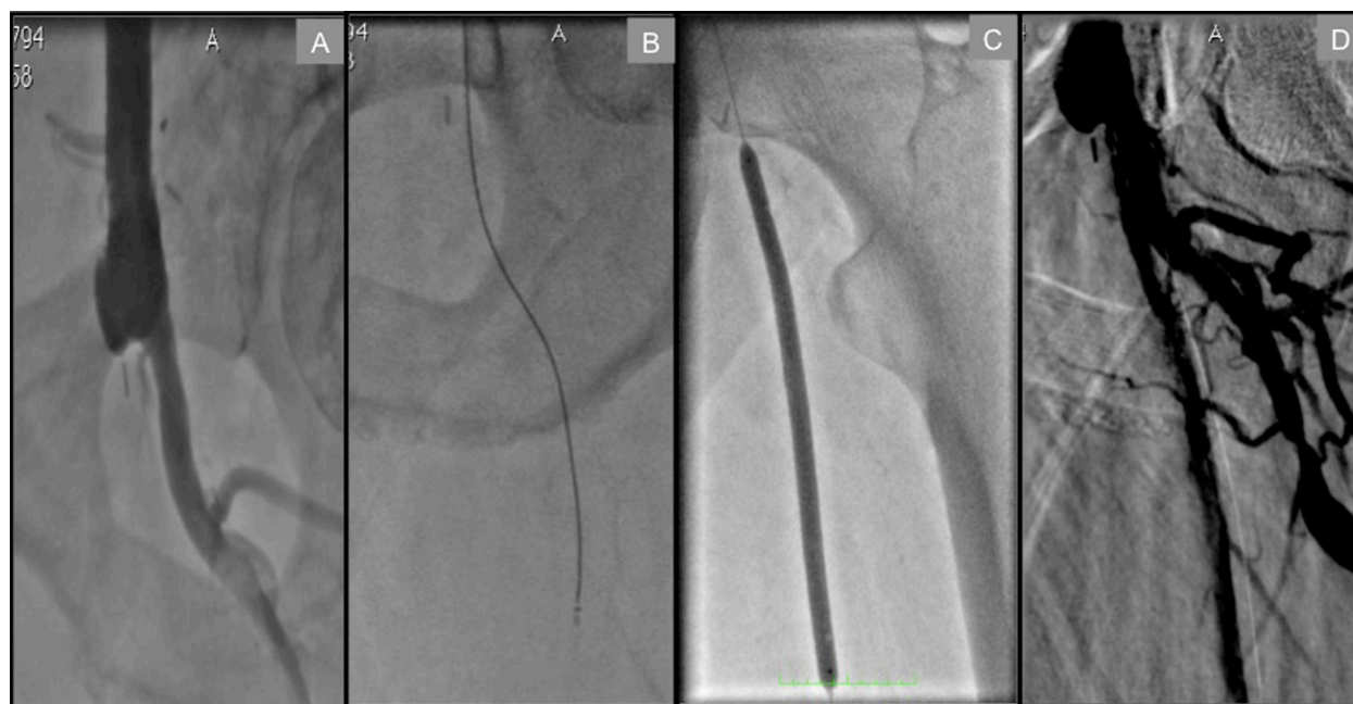
Figure 1 Transradial approach to a left proximal SFA total occlusion in a patient with a history of aorto-bifemoral bypass. A) Distal anastomosis site of bypass conduit to CFA and total occlusion of SFA at its ostium. B) Crossover CTO recanalization catheter™ (Flowcardia) successfully passing through proximal total occlusion. C) Balloon angioplasty of proximal SFA. D) Final result at the end of procedure.

Individuals who have undergone previous surgical revascularization, particularly aorto-bifemoral bypass, pose a unique challenge in that the two bypass conduits usually form an acute angle from their anastomotic take-off