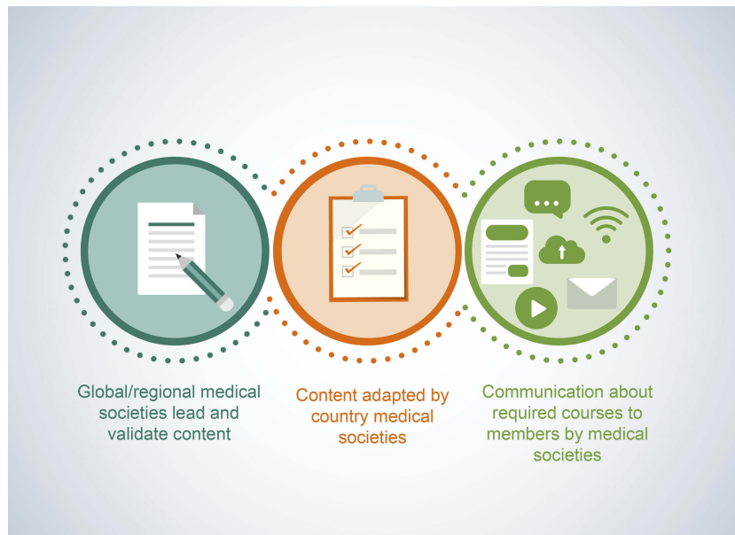
Figure 3 Role of global, regional, and local medical societies in providing CME via MOOCs.

Abbreviations: MOOCs, massive open online courses; CME, continuing medical education; LMS, learning management system.