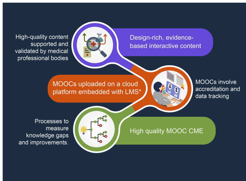
Figure 2 Proposed framework for MOOC implementation for CME.

Notes: *LMS is a platform that hosts and tracks data related to MOOCs, e.g., learner's registration, knowledge assessment, certification, content management, and other "back-end" services. MOOCs can also run without LMS if they do not involve – tracking of learners' data, e.g., for knowledge assessment or instructor's interaction.