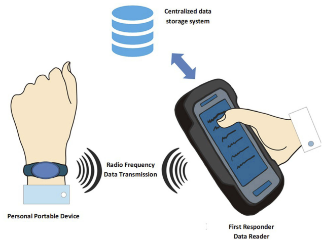
Figure 1 DEPPAS' components.

Figure 1: DEPPAS' components include a personal portable device (PPD) in form of a wristband with an autonomous memory to store encrypted health