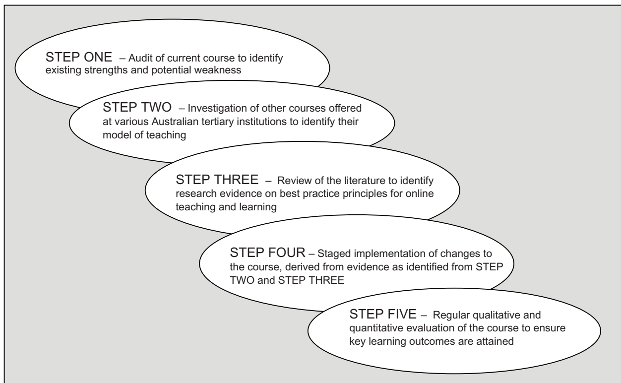
Figure 1 The five step process of change.