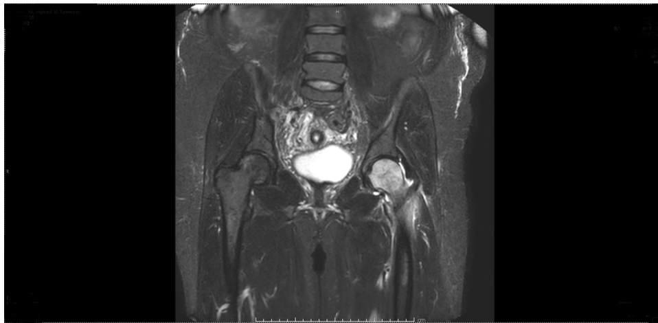
Figure 1 T2-weighted MRI: Coronal view indicating diffuse bone marrow edema of the left hip.