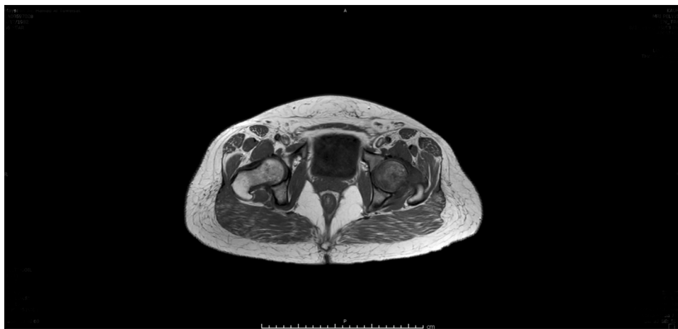
Figure 2 T1-weighted MRI: Axial view demonstrating bone marrow edema of the left hip.

TOH have also been reported, which reinforces the role of venous stasis. 10 It is important to mention that the risk factors (other than pregnancy) suggested for TOH include trauma, alcohol consumption, steroid usage, smoking, hypothyroidism, hypophosphatasia, osteogenesis imperfecta, low testosterone levels, and low vitamin D (25-cholecalciferol). 16–19 In this study, no hormonal abnormalities were detected among our patients, either clinically or biochemically. In addition, no trauma events were recalled. Alcohol consumption was reported in two patients who were not physicians. Accordingly, the occupation of the physician could be considered and investigated as an independent risk factor for TOH. In view of the aforementioned suggested venous occlusion pathophysiology, the higher prevalence of physicians could be explained by their long periods of standing and long work sessions. On the other hand, it would be explained by the easier access for consultations by the