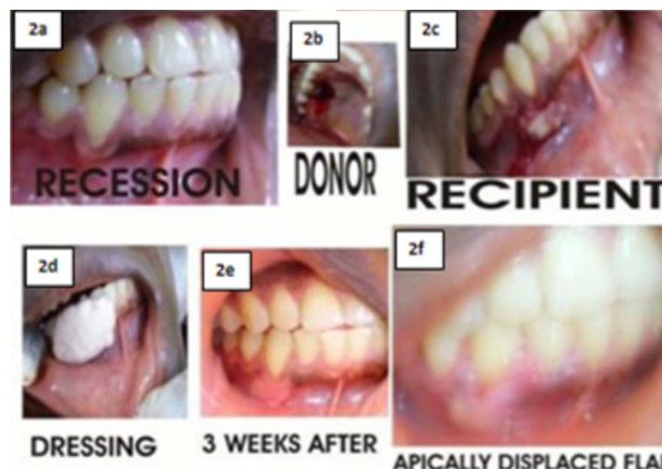
Figure 2 Free gingival autograft for treatment of recession on tooth 43.

Periodontal plastic surgery has been used in several clinical procedures, including those traditionally classified as mucogingival surgery, with little variation in the list. The method used in the cases reported here was the free gingival graft.