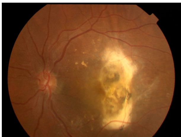
Figure 2 Preoperative fundus photograph of the left eye. Degenerative subretinal fibrosis can be seen.

A population-based study reported that pseudophakic eyes had a 3-fold greater risk of developing AMD than phakic eyes, 1 and another study reported that AMD was significantly associated with hyperopic refractive errors. 4 It has also been reported that there is a higher incidence of a persistent central vitreoretinal adhesion in eyes with exudative AMD than in eyes with nonexudative AMD and age-matched control eyes. 3 The authors concluded that the persistent attachment of the posterior vitreous cortex to the macula may be a risk factor for developing exudative AMD, and that vitrectomy to create a PVD may have prophylactic benefits. Relevant to our case, a regression of a CNV in eyes with AMD has been described after vitrectomy to create a PVD. 5 We found a firmly adherent vitreous cortex around the macula, which