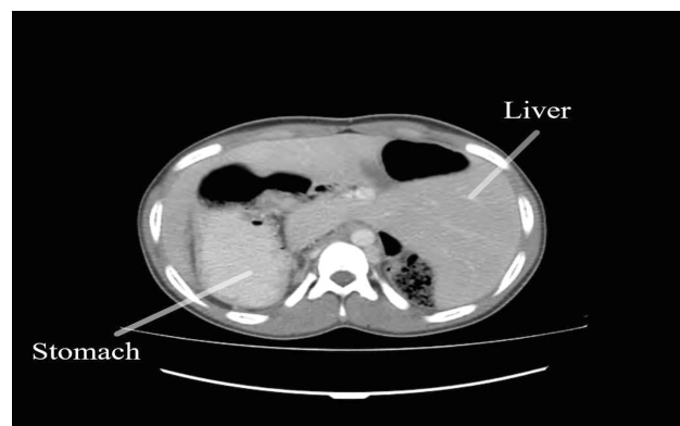
Figure 1 Abdominal CT scan. (A) Location of the cyst and the spleen in the pelvic area. (B) Location of the liver and stomach in the abdominal space.

appendix is located in the RLQ), and a large, thrombosed cystic mass attached to the omentum (with a blood supply from the omentum; normally, the splenic artery is responsible for the blood supply to the spleen), twisted around its axis (clockwise), was seen (Figure 2). The mass and the appendix were resected, and the pelvis and abdomen were washed. After achieving hemostasis, the abdomen was sutured and dressed. The lesion was sent to the pathology laboratory. The pathological findings reported both the spleen and cyst. After surgery, the patient was vaccinated and there were no infectious complications after splenectomy. The patient was discharged in good condition after two days.