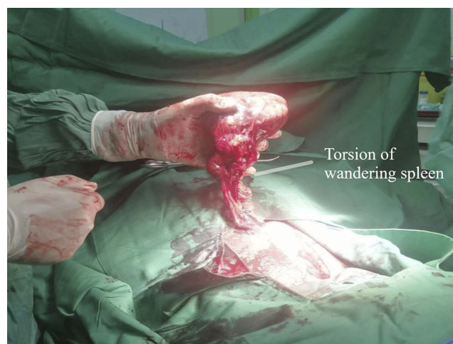
Figure 2 Photo taken during surgery, showing the position of the wandering spleen in the pelvic area.

are asymptomatic, and their ectopic spleen is diagnosed incidentally as an uncomplicated abdominal mass during a physical examination or imaging for other reasons. 7 The patient may experience mild intermittent abdominal pain due to congestion of the spleen as it twists and untwists intermittently, or show the symptoms of acute abdomen due to the torsion and infraction of the spleen vascular base. 3 Other clinical manifestations include nausea, vomiting, fever, leukocytosis, peritoneal stimulation signs, and a palpable pelvic or abdominal mass. The patient in the present study had a wandering spleen in the pelvic area attached to the omentum (with a blood supply from the omentum) with symptoms of severe pain in the abdomen, fever, nausea, vomiting, and lack of appetite.