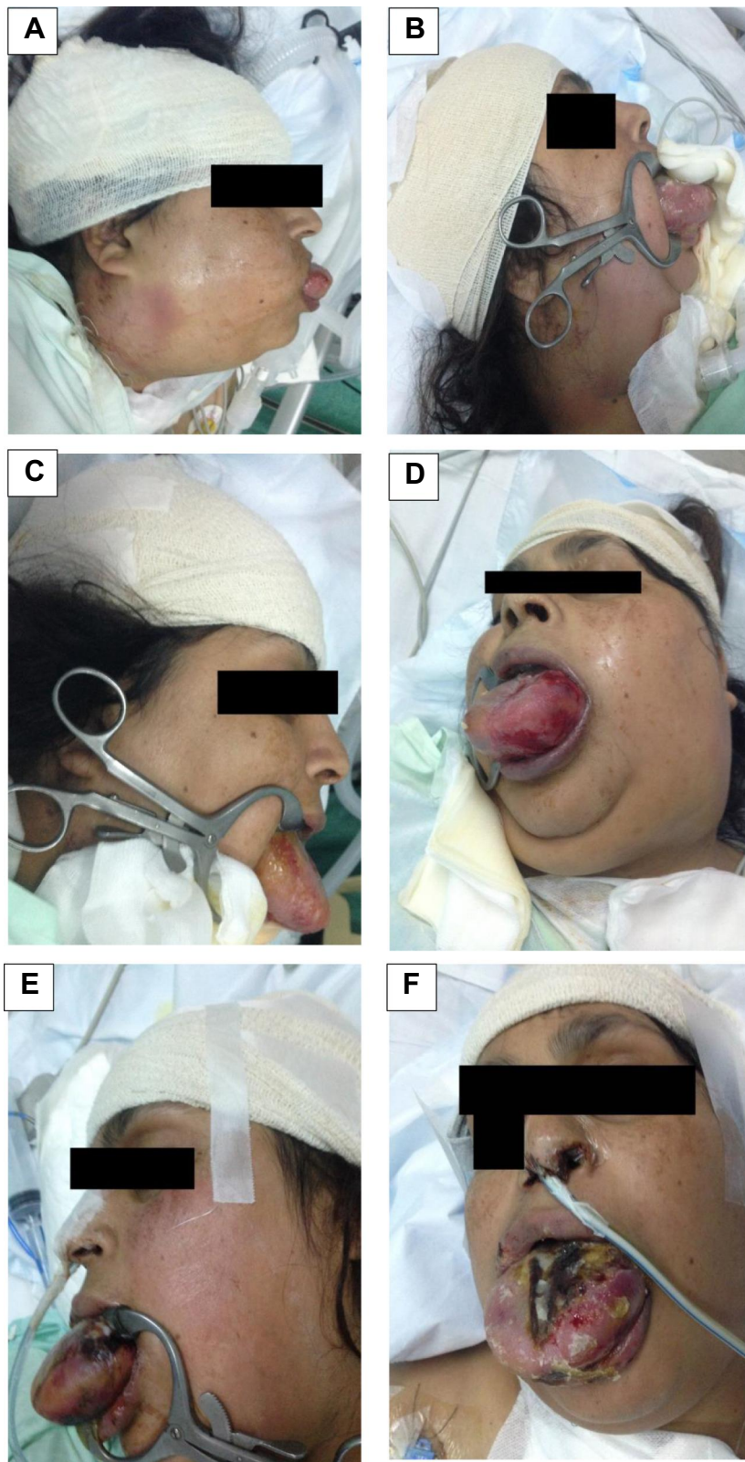
Figure 1 Postoperative macroglossia: (A) on the day of surgical intervention after being transferred to the ICU; (B–D) 2 days later, after which there was an increase in the swelling of the tongue and neck; (E–F): nine days later, after which she had a further increase in the size of the tongue with ulcerations on its surface.