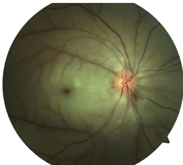
Figure 1 Fundus photograph of the right eye at presentation showing typical features of central retinal artery occlusion (CRAO). Peripapillary axoplasmic ring with peripapillary hemorrhages, white ischemic retina, attenuated arterioles and central cherry red spot is evident.

Gestational trophoblastic neoplasia (GTN) arises from abnormal proliferation of placental trophoblasts and includes