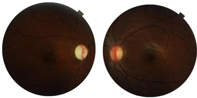
Figure 2 Fundus photograph of both eyes at the end of 1 year follow up. Optic atrophy with attenuated vessels is evident in the right eye whereas the fundus is within normal limits in the left eye.

a group of interrelated lesions. GTN are generally highly responsive to ACC. 8 The composite regimen of chemotherapeutic agents in our case unambiguously point towards the high risk and resistant variant of GTN. 9