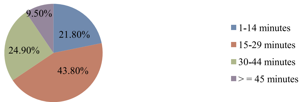
Figure 2 Waiting time to get laboratory services and results for chronic diseases patients who had follow-up visit at health facilities in North Shoa zone, Oromia region, from May 1 to June 30, 2020 (n=410).

entrance and washed their hands before entry to a health facility. Nearly two-thirds of participants have observed and maintained physical distance at registration, waiting area, laboratory, and pharmacy areas. Regarding clinicians wearing gloves and masks, participants have mentioned 80.5% and 89.5% of clinicians wearing gloves and masks, respectively, while providing healthcare services. More than two-thirds of healthcare facilities had no hand cleaning alcohol at the entrance of their compounds. Only 56 (14.4%) of the study participants were reported the availability of COVID-19 screening services at healthcare facilities [Table 3].