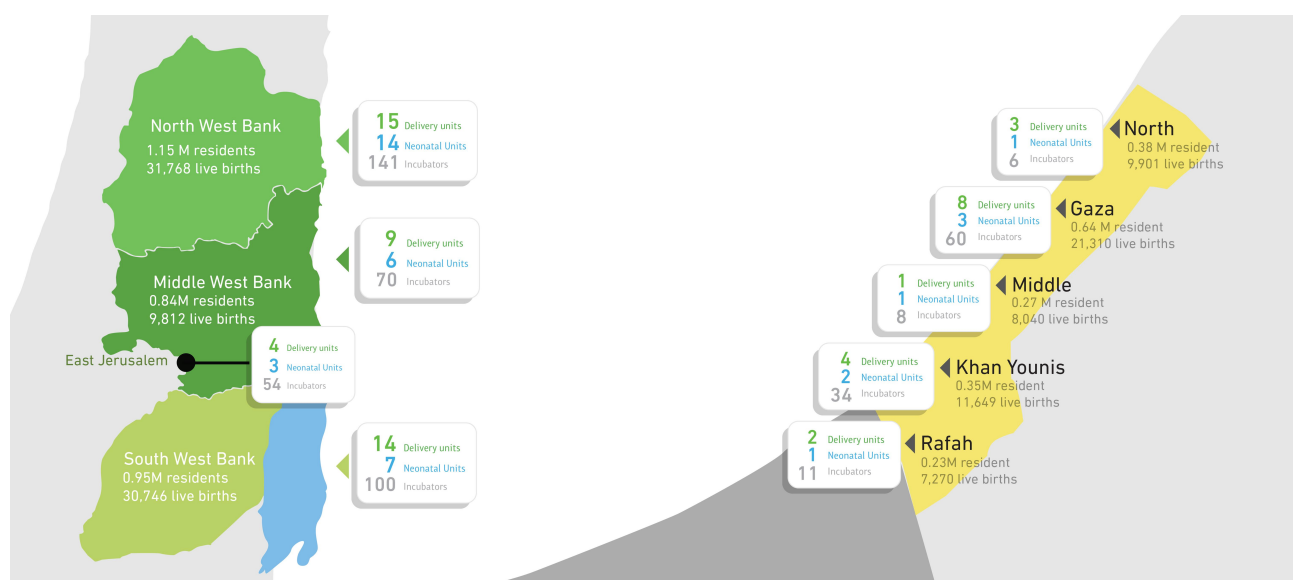
Figure 1 Availability of delivery units, neonatal units, and number of incubators in Palestine by region and geographic area, 2017.

The study data indicated that there was a shortage in the availability of high-frequency oscillatory ventilation (HFOV) across hospitals in Palestine. Also, several hospitals in the WB