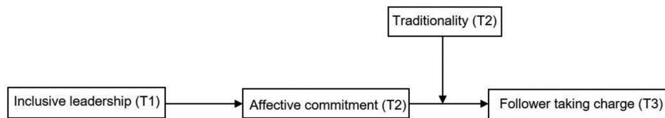
Figure 1 Hypothesized research model.