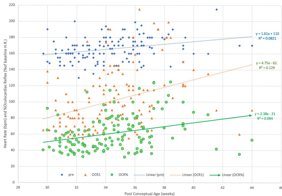
Figure 2 Influence of gestational age on oculocardiac reflex during ROP exams: Patients who had at least six serials exams. Blue diamonds represent the stable pre-exam heart rate, orange triangles represent the maximally changed heart rate during lid speculum, scleral-depressed indirect ophthalmoscopy exam and green circles represent the OCR as a percent of stable pre-exam heart rate.

General anesthesia utilized with strabismus surgery is a substantial difference when compared to awake ROP Exams. Oculocardiac reflex has been documented in awake strabismus patients, also. 21 Certain substances can augment oculocardiac reflex during strabismus surgery