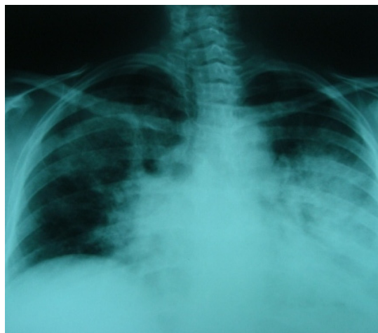
Figure 1 Chest X-ray upon admission.

To identify the source of the infection, the patient's relatives were interviewed. Exposure histories revealed that the patient had travelled abroad and visited an operating spa pool 2 weeks before the day of onset. After she returned, she remained in her village until her admission to hospital. As there were no cooling towers or any aerosol-generating systems in an area of 2 km from the house, and there was no access to the spa pool abroad, environmental samples were taken only from the home water supplies, and standard methods were processed. Water samples revealed an absence of Legionella spp. from the domestic water supplies.