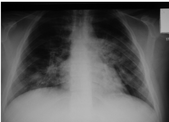
Figure 3 Chest X-ray after levofloxacin was added.

Legionnaires' disease occurs sporadically and in outbreaks, with the sporadic form representing 65%–82% of the cases. 10,11,15 Nevertheless, the number of confirmed community outbreaks including more than 100 cases has increased in recent years due to the use of Legionella antigenuria. 11,15 Routine testing for Legionella urinary antigen has increased the number of diagnostics of Legionnaires' disease and has allowed earlier diagnosis and treatment, greatly improving the prognosis. 16 This has been particularly true for milder cases, mainly in the outbreak setting. 17 However, most of the knowledge on risk factors, clinical presentation, and outcome